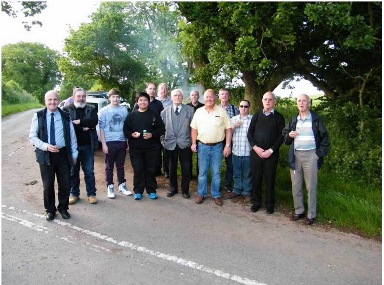
Illustration 1

g) Persons joining the Society after the ANNUAL GENERAL MEETING shall be liable to pay subscriptions on a pro-rata basis for the months remaining. For the purpose of these rules, family membership will count as ONE member. Membership rules are published on the official website of the society. A Printed Copy may be requested as required.