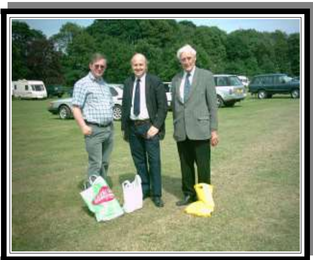
Elvaston reading left to right

Rugby was were the GPO clock on 2.5m came from, but its all gone onto Satellite..