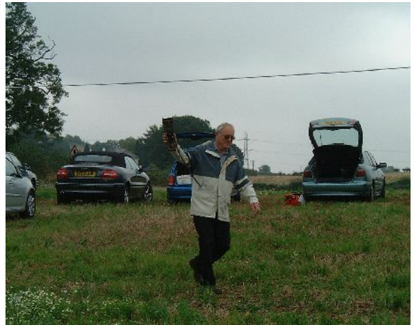
But the weather looks ominous