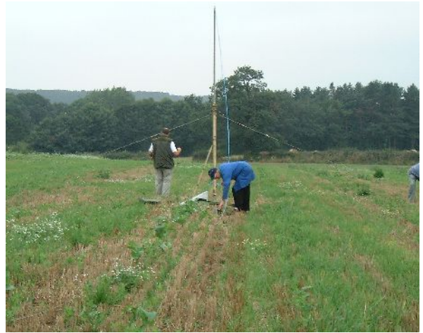
Ha yes it must be safe now