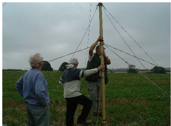
Yes its up – lets hope it stays there