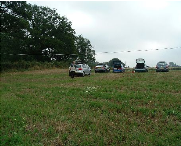
First the tent- sort of in the middle