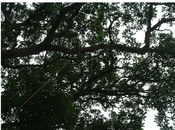
It must be nearly there

Its THAT tree again – but it gave us less trouble